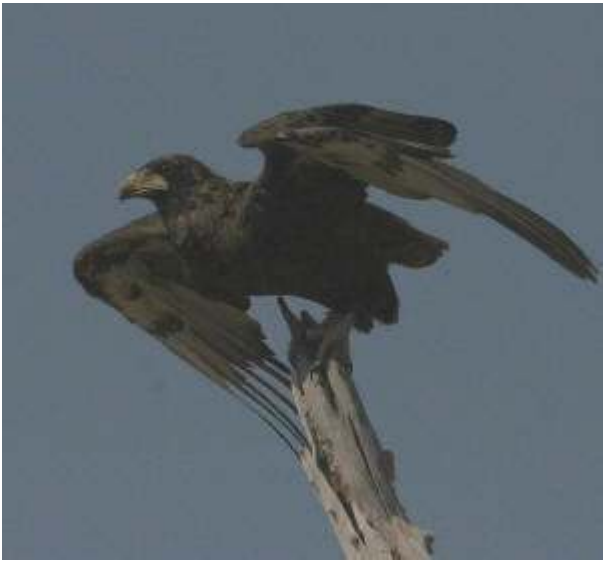
African Hawk Eagle