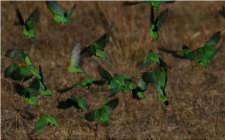
A flock of Lillian's Lovebirds