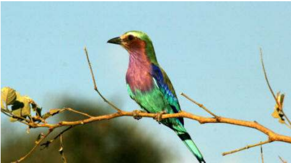
Lilac Breasted Roller

This juvenile Pels Fishing Owl on the right is a very special bird. Extremely rare and top of the list for birders we are lucky enough to have two residents near Kaingo. It seems they have been breeding successfully.